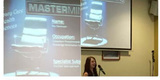
3:17 PM - 13 Oct 2017

Sharing stratified care using mastermind style format at patient conference @PCSciences @stevenawoor