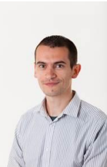
Dr Mal Palin Clinical Academic Training Knowledge Mobilisation Fellowships