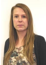
Rebecca Savage Doctoral Research Fellowships